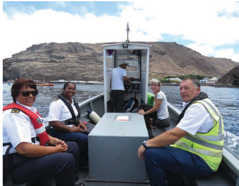
Above: Heading to shore in the harbor taxi at St. Helena in the southern Atlantic Ocean. Two customs officials (left), and the harbor master (right) came out to clear us through, then we completed the clearance with immigration at the police station ashore.

Travelling with Spitfire taught us about several loopholes where some countries with stringent animal entry requirements are more lenient with animals traveling from specific countries. For example, pets brought by yacht into Australia are quarantined for a minimum of thirty days. But qualifying pets coming from New Zealand can enter quarantine-free, and New Zealand's minimum quarantine period is 10 days. Another example is that pets cannot be