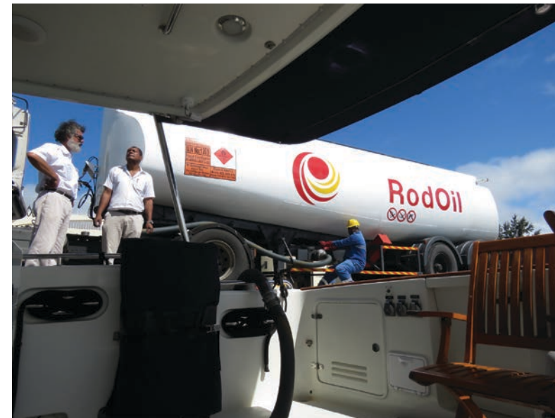
Above: Rodrigues, Mauritius was among our most difficult fuel fills of the trip. After spending the morning filling out paperwork and purchasing the fuel, the truck arrived with only a four-inch diameter hose and no nozzle to control the flow from their high-speed pump. We had to gravity-feed to avoid spills and were lucky to the job done in just one day. Middle: Withdrawing Mauritius Rupees at an ATM in Rodrigues, Mauritius. Partway through the trip we switched to credit and ATM cards without foreign transactions fees. Below: Hoisting our first foreign port after leaving Hawaii. Several officials commented that they appreciated our showing respect for their country by having the appropriate flag on board.