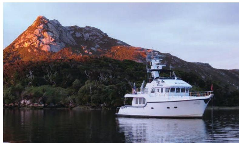
Below: At anchor off Bald Cone on Stewart Island, the southernmost of New Zealand's three major islands. A few days earlier we'd reached 47° 2' South as we passed Southwest Cape, one of the five Great Capes and the first of three that we've rounded.

Zealand, and Australia. All other countries had no requirements so long as he remained on board. Fiji, however, levied a bond of approximately $500 to be refunded when customs sights the pet on exit. We've heard reports that it can be difficult to "find" the appropriate customs officials to recover the deposit on exit. Our Fiji agent posted the bond on our behalf and reclaimed their funds after we'd left.