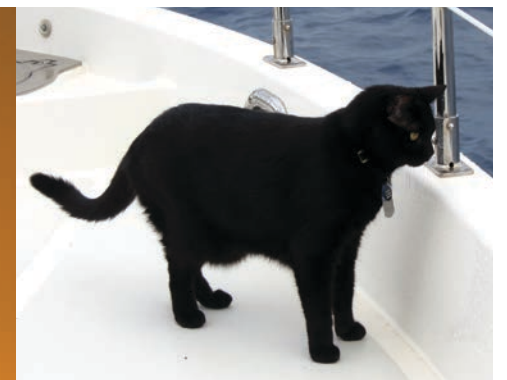
Spitfire on deck in French Polynesia.

http://mvdirona.com/2010/06/cruising-with-cats/