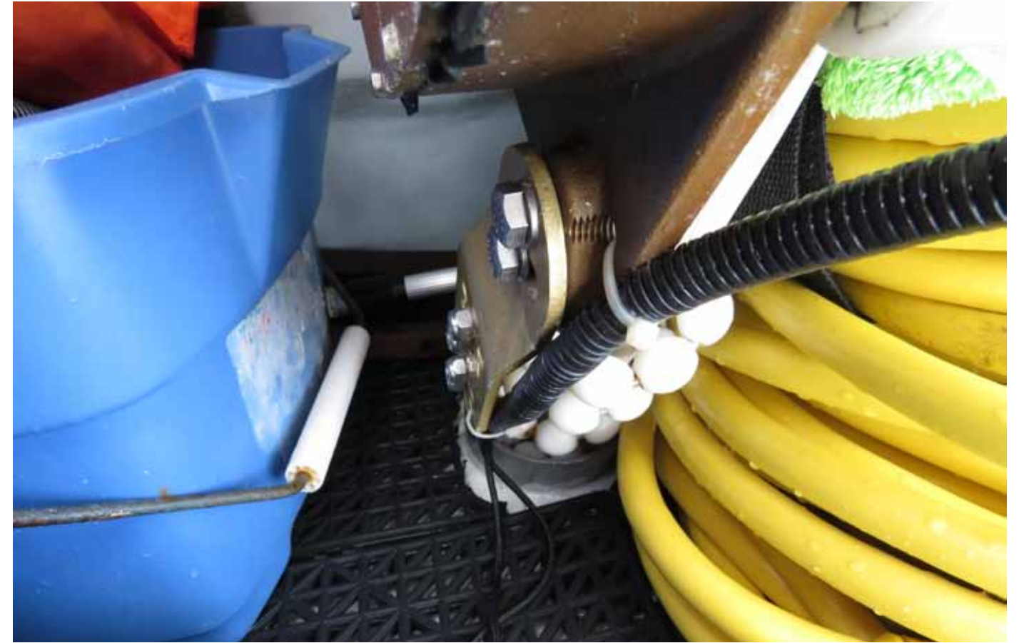
Opposite: This marine version of a tourniquet on the power cord entry substantially reduced the rate of water inflow. Above: The cockpit locker frequently contained several inches of water, and seawater was pouring into the lazarette through the shorepower cord standpipe.

The likely options for water getting into the storage locker were: 1) Glendinning power cord entry, 2) the right side grab rails, 3) the swim step attachment, 4) the locker drain hole, 5) the locker door, or 6) the louvers in the door. Hanging on as securely as I could manage, I looked out over the transom to the swim step, using a head lamp and a bright flashlight. It looked solid. I checked