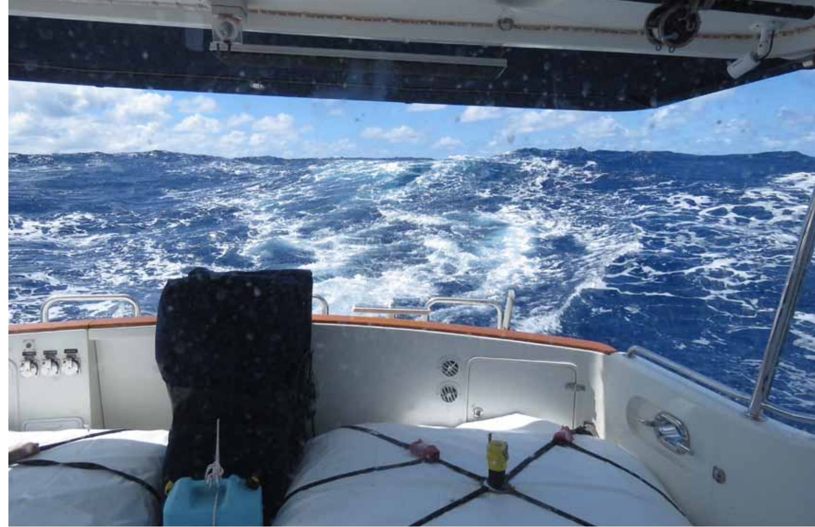
Opposite: The rivets holding the valves in place on the Jabsco model #34600-0010 pump can corrode and fail at any time. The pump should not be counted on for more than routine bilge dewatering. Above: This was the first ocean crossing where we've felt serious doubts—even a touch of fear—and actually considered turning back.

Really? Even more annoying, the boat's motion rolled it to an impossible-to-reach location.